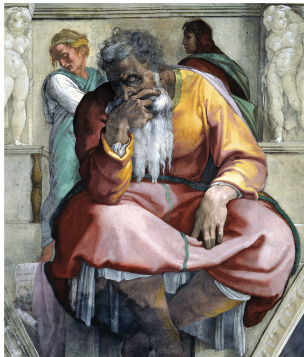
Piece: Jeremiah, 1510-1512 Artist: Michelangelo